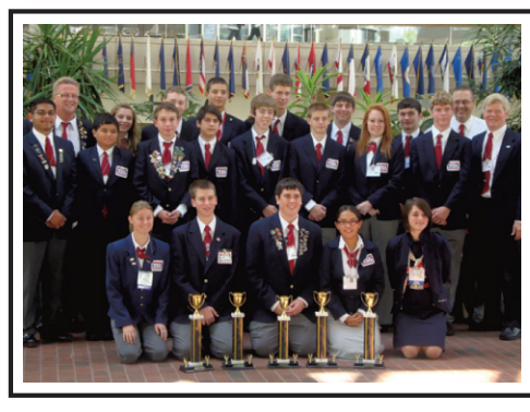
Bradén River High School competitors.