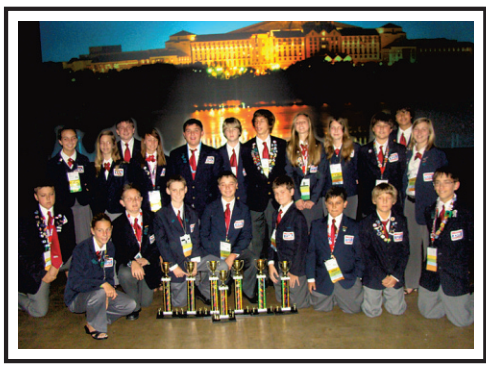
Haile Middle School competitors.

The TSA Dragster event winners' rankings for middle and high school students—just a sample of how Manatee County clearly shines!