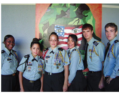
Everyday heroes— Bayshore's School of Health, Science and Public Service JROTC cadets in front of student-designed artwork.