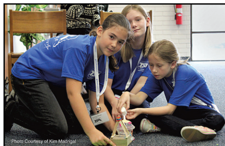
Elementary engineers launch catapults.