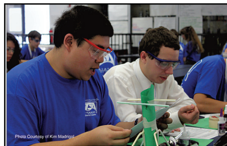
Working as a team in technology problem solving.