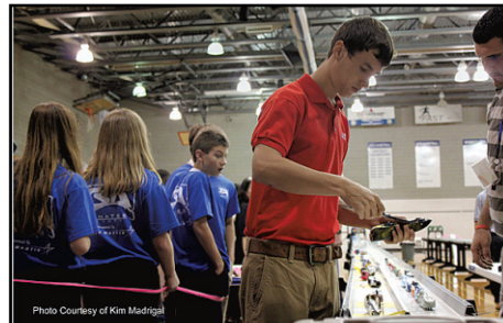
High-speed dragsters must meet stringent requirements.