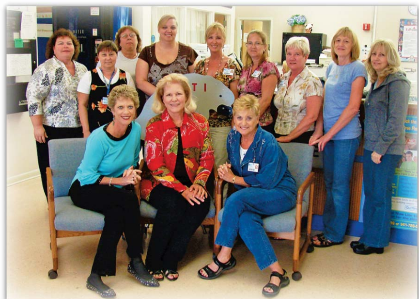
Some of the teachers and staff from Manatee Technical Institute (MTI).