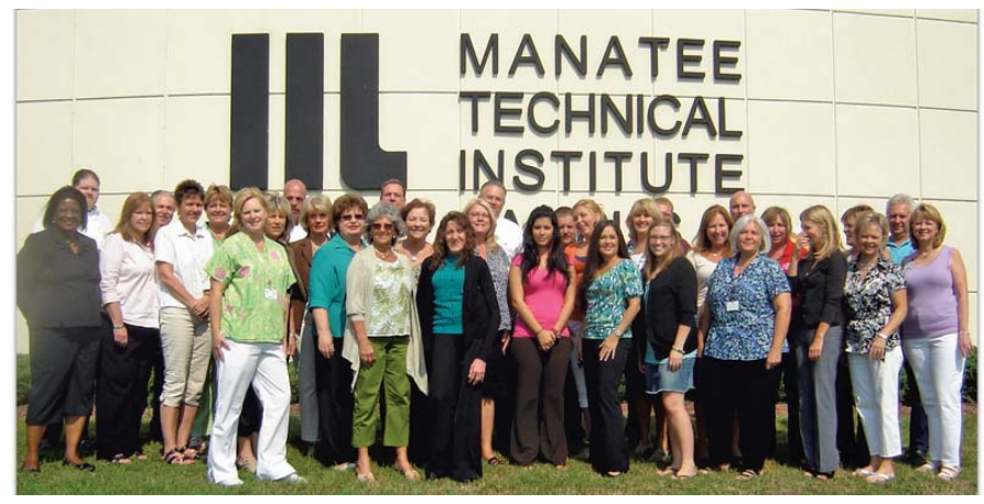
Some of the amazing MTI East Campus staff.