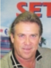
By Leslie Rowe

(Note: for a virtual tour of the SEHS TV studio, visit www.virtualtours-sarasota.com/setv )