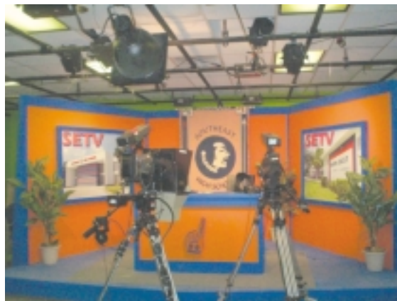
By Leslie Rowe

The following teachers head up TV production in Manatee Schools. Eighth graders and freshmen, why not stop in and visit their classrooms to find out if TV production is for you?