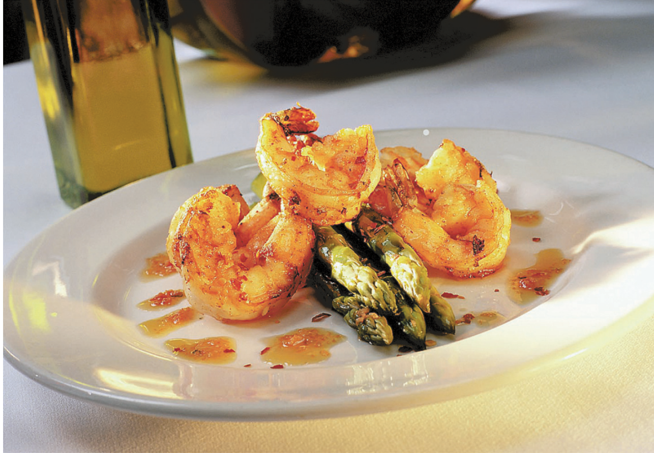
With catered food, presentation can mean everything. Most caterers have a variety of items they are particularly adept at cooking, but they must be able to alter them to meet customers' needs.

T hink weddings, balls, parties, festivities, and food, and “caterer” comes to mind. Yet while caterers often start their business because of the joy they find in cooking and watching people eat their creations, the eating experience is often just the icing on a very difficult cake for caterers.