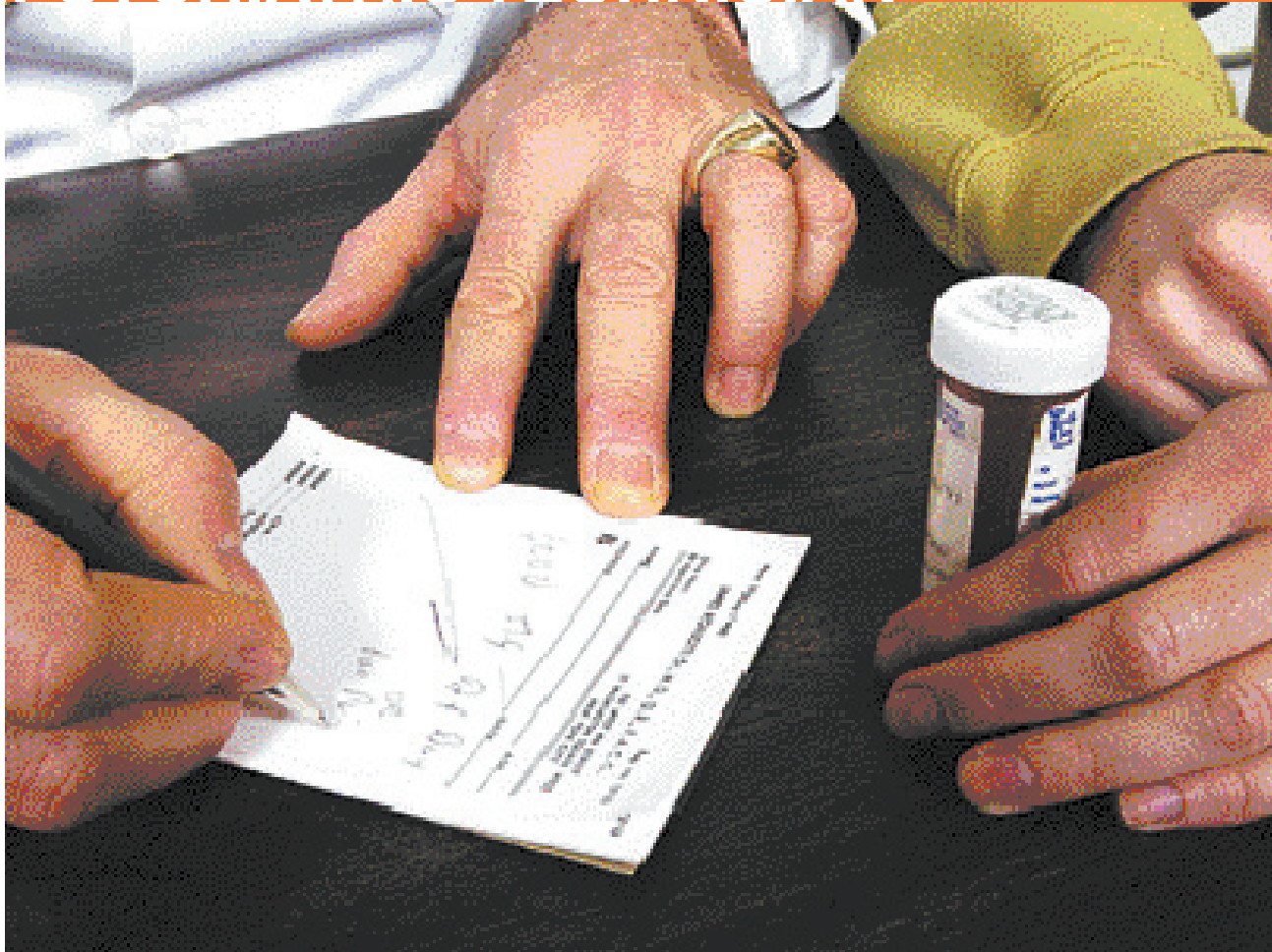
Psychiatrists determine treatment plans for patients who are suffering from mental illnesses or emotional disturbances, often prescribing medications as part of a patient's treatment plan.

A psychiatric technician's job is to provide care to mentally ill patients. There are many places that psychiatric technicians can work including hospitals and mental health clinics. Psychiatric technicians have several job duties they must perform while on the job. They help patients with their personal hygiene and administer oral medications and hypodermic injections. They take and record measures of patients' general physical condition, observe patients' behavior patterns and report observations to medical staff, issue medications, and maintain records in accordance with specified procedures.