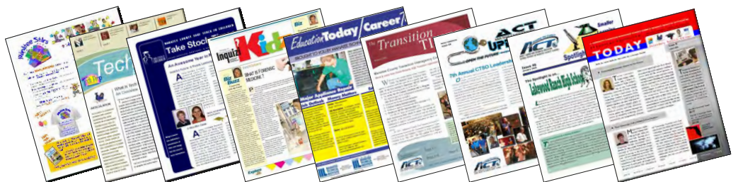
Manatee Stars, Tech Prep, Take Stock Times, Inquizikidz, Education Today/Career Tomorrow, Transition Times, ACT Update, Spotlight on Success, and Technical Education Today.

Watch for all of the publications keeping you informed about what's happening around the District in the Adult, Career & Technical Education department.