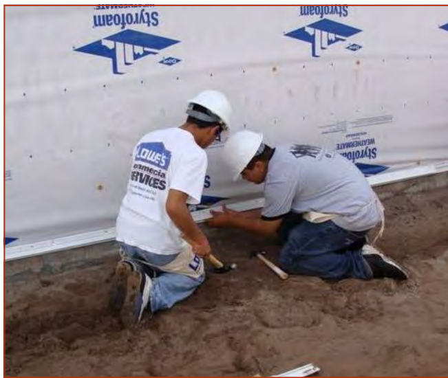
Interior design students (top) and construction technology students are equally at home in the Center for Design and Construction.