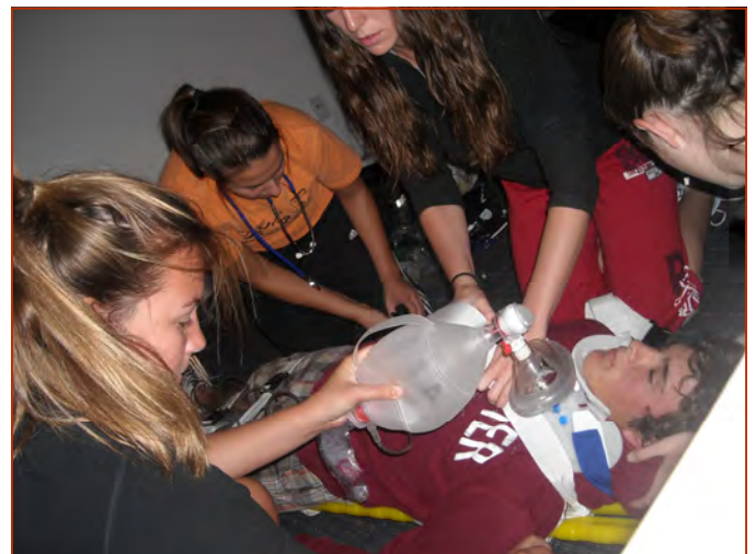
Medical Arts students perform emergency first aid on an "accident victim."

T he Academy of Medical Arts and Sciences provides students with a strong academic curriculum combined with core health courses. Relevancy is a vital aspect of the program and is fostered through job shadowing and internships. Community support is vast with over fifty students participating in internships this year. Whether a student's interests lie in small animal veterinary medicine, massage therapy, pharmacy, or a host of other careers, the Academy of Medical Arts and Sciences has much to offer.