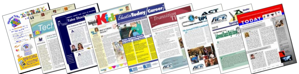
Manatee Stars, Tech Prep, Take Stock Times, Inquizikidz, Education Today/Career Tomorrow, Transition Times, ACT Update, Spotlight on Success, and Technical Education Today.

W atch for all of the publications keeping you informed about what's happening around the District in the Adult, Career & Technical Education department.