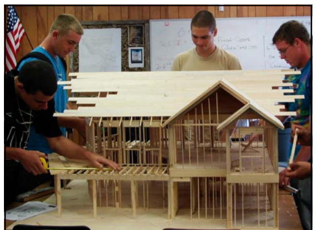
Construction Academy students frame their challenging chalet house.

Outside of class, Construction Design Academy students and staff are collaborating with Habitat for Humanity and are volunteering their time and skills to build homes for families in