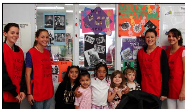
Education Academy students present their Black History Month celebration to their toddler charges.

PHS boasts a pre-kindergarten program, which gives students the opportunity to observe and research preschool-aged students in a daycare setting. High school academy students work hand-in-hand with the Tiger Tots staff by relating to the toddlers and by creating activities which are implemented at the childcare facility. Students write lesson plans, implement lessons in the classroom, and write and illustrate children's stories. In February, academy students observed Black History month. They researched, wrote essays, and finally created PowerPoints on inspirational events and