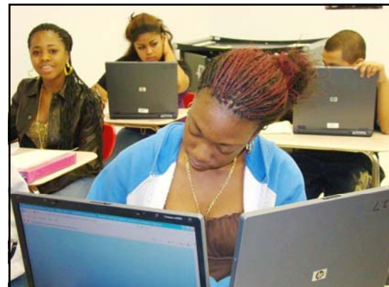
Students in the Liberal Arts and Leadership center use laptops to enhance their studies and prepare for postsecondary education.

of this relationship are that students build leadership skills, intellectual curiosity, become sensitive to societal problems, and develop the drive to improve the world.