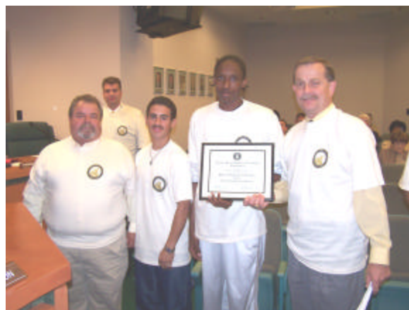
Future Builders of America receive recognition at Manatee County School Board Meeting