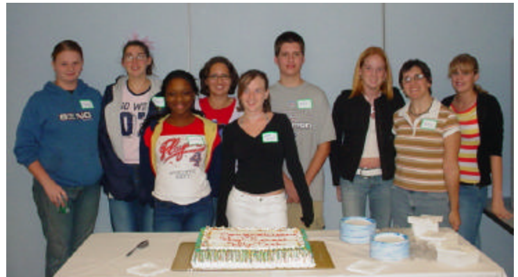
High School/High Tech celebrates at annual kick-off November 9th at Manatee Community College