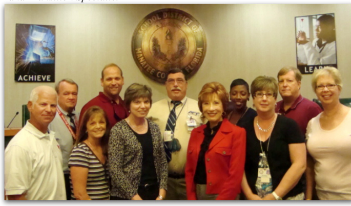
Secondary Transition Team: Job Coaches, VR Employment Specialists, and Transition Specialist