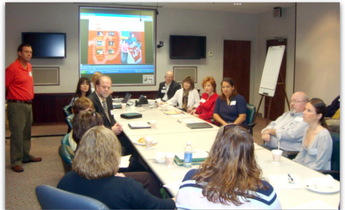
MBLN members meet to strategize on best business practices.