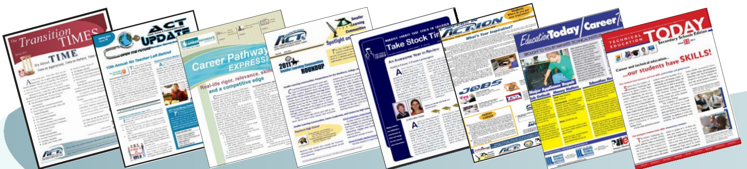
Transition Times, ACT Update, Career Pathways, Spotlight on Success, Take Stock Times, Careers in Action, Education Today/Career Tomorrow, and Technical Education Today.

Watch for all of the publications keeping you informed about what's happening around the District in the Adult, Career & Technical Education department.