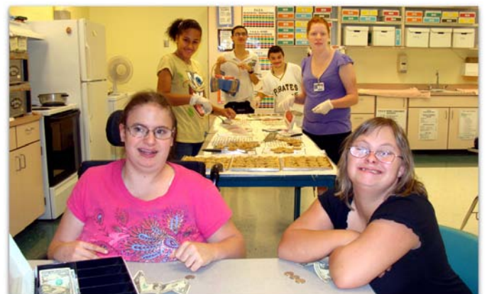
Bayshore bakers learn the sweet business of success.

The Bruin Bakery orders unbaked cookies from Otis Spunkmeyer. Cookies are baked, cooled, and packaged at the cost of $1.00 per bag. Teachers call the bakery to place their order and ask to have the cookies delivered to their classrooms, or students can purchase at the bakery door. All students have a role in the cookie business.