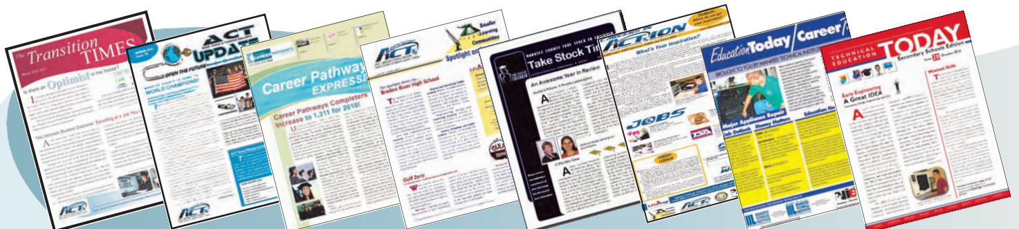
Transition Times, ACT Update, Career Pathways, Spotlight on Success, Take Stock Times, Careers in Action, Education Today/Career Tomorrow, and Technical Education Today.

Watch for all of the publications keeping you informed about what's happening around the District in the Adult, Career & Technical Education department.