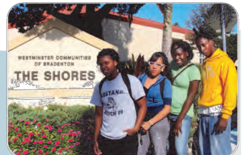
BHS students work at the Westminster Manor (top) and the Shores.