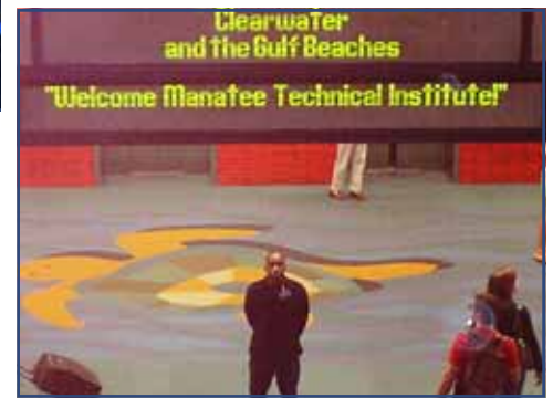
MTI students take an insider tour of Tampa International Airport.