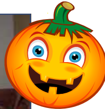
(Top left) Students judge the LRM C Jack-o-lanterns at the annual pumpkin carve.