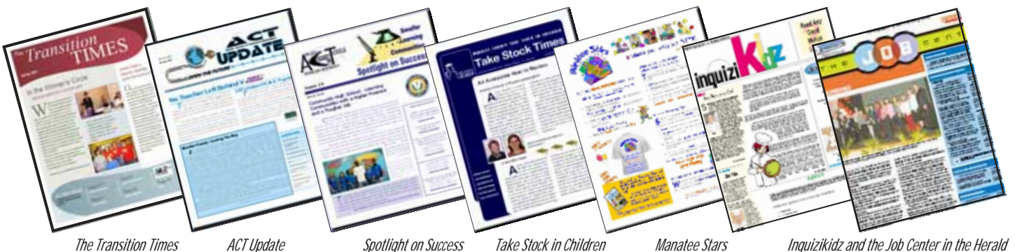
The Transition Times

Watch for all of the publications keeping you informed about what's happening around the District in the Adult, Career & Technical Education Department.