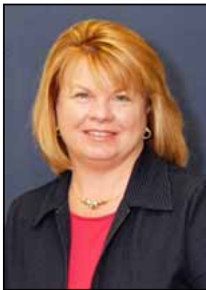
...a strong sense of commitment to both the community and its children.

TurboCharge 2 is revving up! Please contact us immediately if you know of a person, company, foundation, or organized club that will invest in the children of our community.