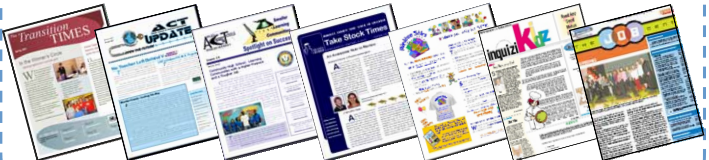
The Transition Times

Watch for all of the publications keeping you informed about what's happening around the District in the Adult, Career & Technical Education Department. To view past issues, visit www.ManateeACT.com and click News .